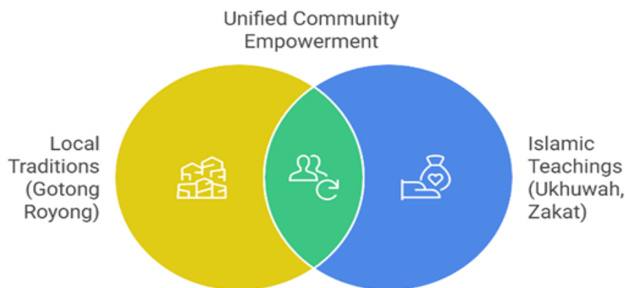
Figure 1. Synergy of Tradition and Faith in Community Solidarity

The role of religious leaders in these initiatives cannot be understated. In several villages, religious leaders actively encourage participation in community development activities by linking these activities to the fulfillment of zakat (charitable giving) and waqf (endowment). Zakat , in particular, has been a crucial tool in fostering solidarity, as it is often distributed to support community-based initiatives such as local health clinics, schools, and small businesses. This alignment between Islamic teachings and local practices reinforces the strength of social networks and builds trust within the community, which is essential for long-term empowerment [31]–[34].