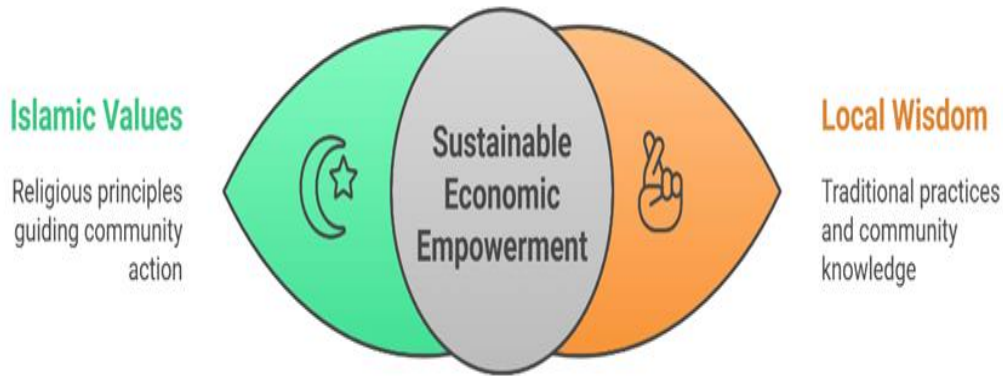
Figure 2. Synergy for Economic Empowerment

Additionally, the practice of gotong royong has facilitated the pooling of resources for collective economic activities. In some villages, this practice has been extended to build local businesses and cooperatives, creating opportunities for collective wealth-building and the sharing of profits among members. This cooperative model is rooted in local wisdom and helps to reduce economic inequality, aligning with Islamic principles of fairness and social justice [43]–[46].