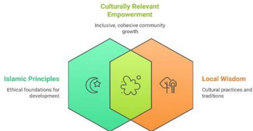
Figure 5. The Power of Integrated Community Empowerment