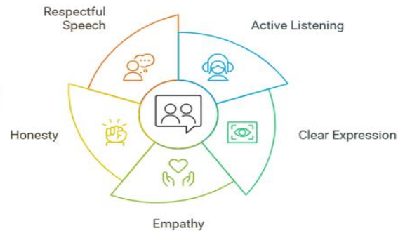
Figure 3. Enhancing Communication Skills Through IRE

positively influenced their ability to connect with others on a deeper emotional level, whether in family relationships or community work.