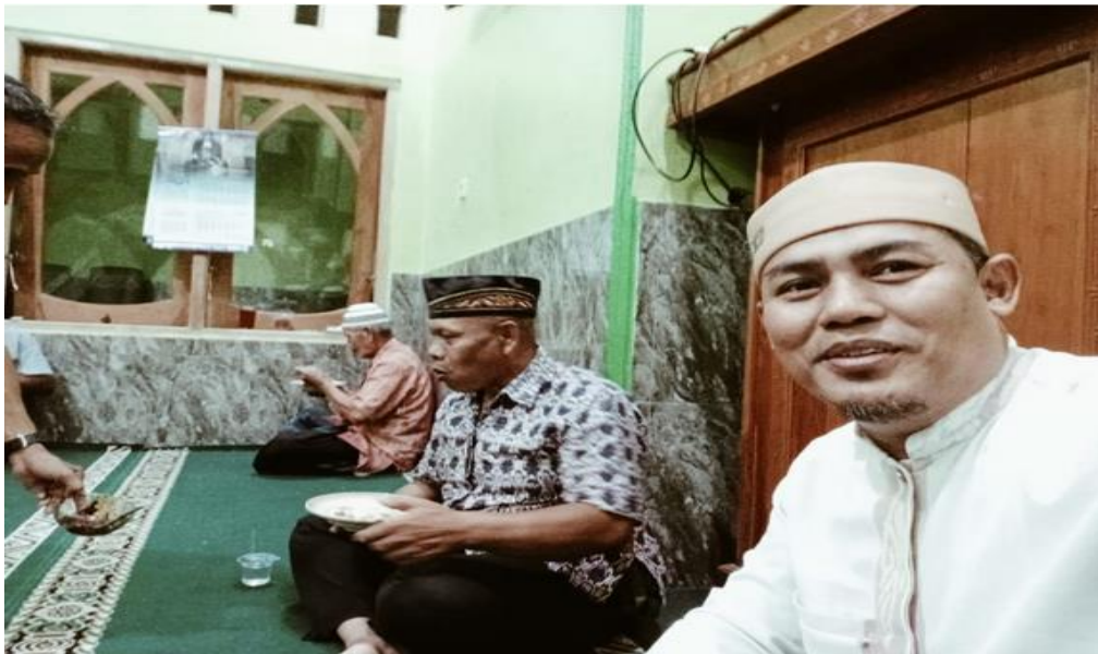
Figure 1. Fostering Islamic Religious Education for Improving Life Skills in Society in a Parent Community.

The findings of this study reveal significant insights into the role of Islamic Religious Education (IRE) in enhancing life skills within communities. Through the thematic analysis of the interview data, four major themes emerged that illustrate how IRE contributes to the development of key life skills: communication skills, emotional intelligence, social responsibility, and conflict resolution. These themes reflect the core aspects of IRE that impact both personal and community development, fostering a range of practical abilities that are critical in modern social and professional settings.