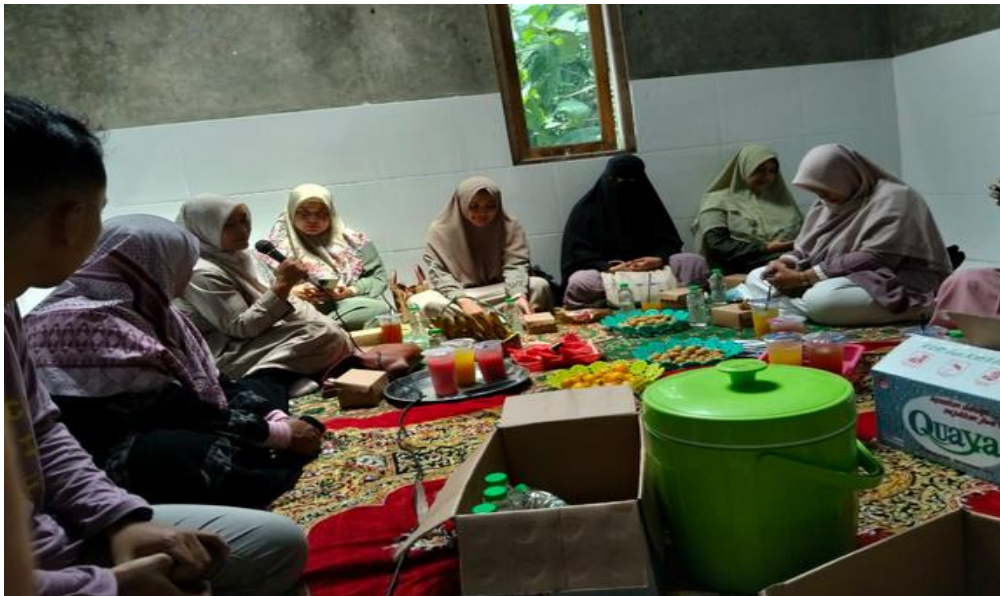
Figure 2. Community Participation in Islamic Friendship and Religious Activities

For example, one participant mentioned, “In our teachings, we are reminded that to truly communicate, we must first listen. This is something I have applied in both my family and work life, and it has helped me build stronger relationships.”