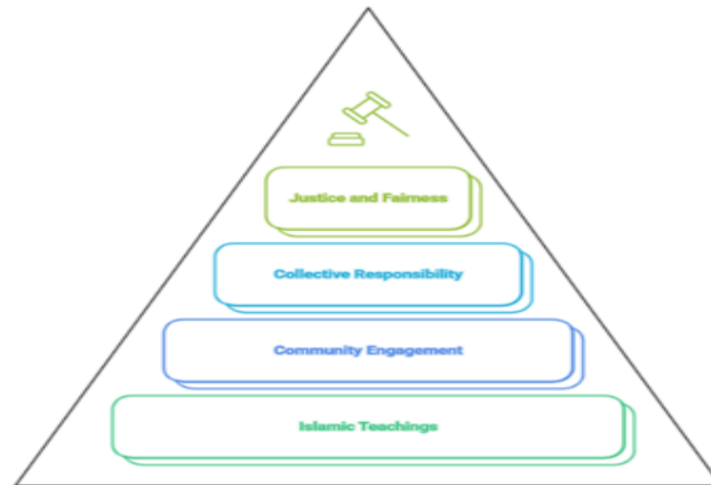
Figure 5. Islamic Responsibility Pyramid

These values helped foster a greater commitment to social welfare and a strong sense of ethical responsibility toward others [42]–[44].