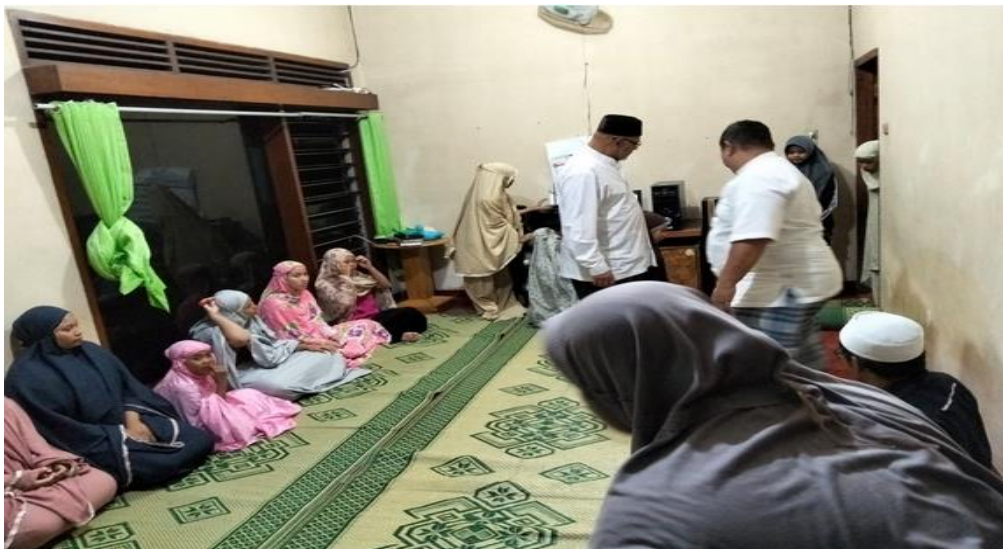
Figure 4. Community CSR Development in Orphanages to Improve the Welfare of Student Welfare in Islamic Institutions

The theme of social responsibility was another major finding in this study. Many participants emphasized that IRE instilled in them a sense of duty not only toward their immediate families but also to the broader community. Islamic teachings, particularly those on charity ( zakat ) and voluntary giving ( sadaqah ), were seen as essential for developing a mindset of service and community engagement. Participants noted that IRE encourages individuals to view their actions in relation to the larger social good, fostering an ethic of collective responsibility.