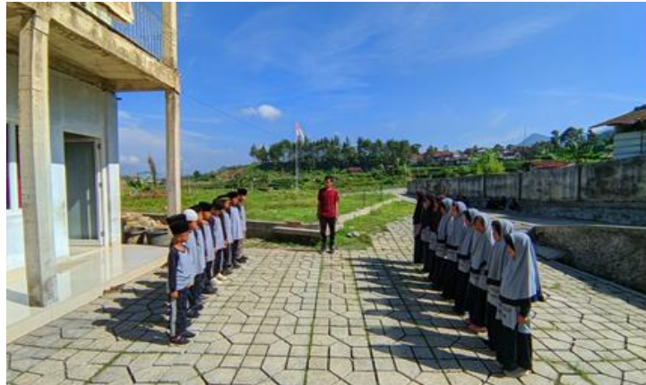
Figure 2. Morning Ceremony

The research was conducted at Kuttab Karanganyar, an Islamic educational institution that is active in fostering children's character through learning the Qur'an and morals [28]. The subjects of the study include teachers, Kuttab managers, as well as students and parents of students involved in the educational process in Kuttab [29].