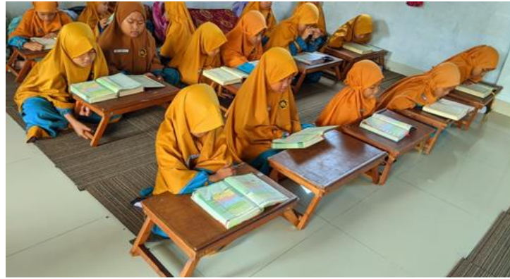
Figure 4. Reciting The Quran Together