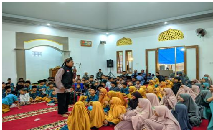
Figure 1. Character Formation

Kuttab is a traditional Islamic educational institution that has existed since the time of the Prophet and developed widely during the Caliphate. Initially, Kuttab functioned as a place to learn to read, write, and memorize the Qur'an for early children [21]. According to Nasution (1999), Kuttab became the initial foundation of the classical Islamic education system before the establishment of formal madrasas. In the contemporary era, Kuttab has been revitalized with a more systematic and structured approach, especially in fostering children's character [22]. The main emphasis remains on tahfizhul Qur'an, the development of manners, and the practice of daily worship. Modern kuttab also integrates Qur'anic values with character-based educational methods [23].