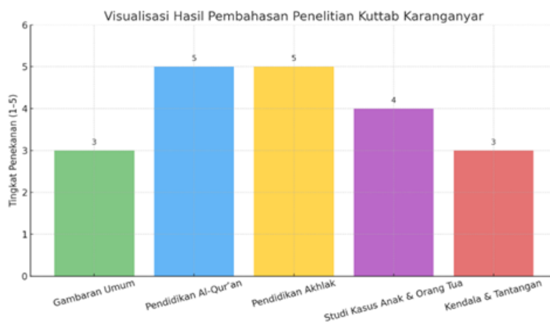
Figure 5. Graph of the results of the discussion

However, there are several obstacles faced by Kuttab Karanganyar, such as limited facilities, limited learning time because children also have to attend formal school, and challenges in maintaining consistency in learning at home. However, Kuttab continues to strive to improve the quality of education by conducting training for teachers and taking a more intensive approach to parents [39].