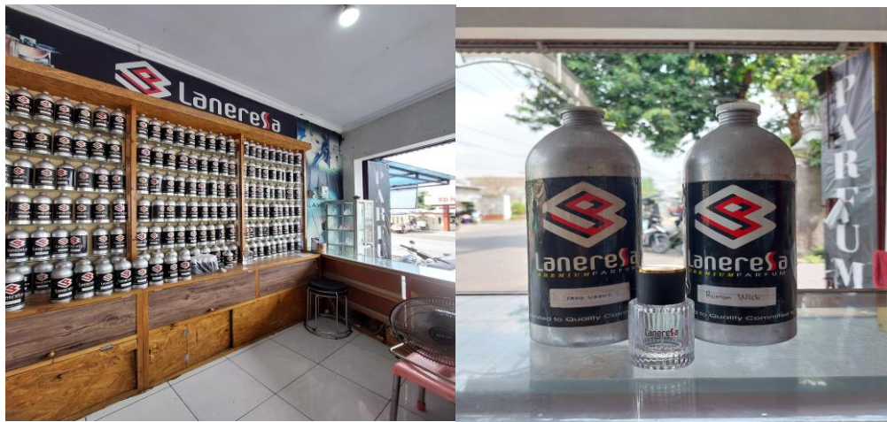
Figure 2. Perfume Products in Lanaressa

For carving lanaressa perfume store bottles have several sizes, there are several smear bottles and there are several spray bottles. The smear bottle has 2 sizes of 10ml and 15ml. And the spray bottle consists of 15ml, 25ml, 35ml, 50ml, 75ml, 100ml, 150ml, 200ml. For the price of perfume seeds per ml, there are 2 variants. Regular seed variants cost 1000/ml and premium seeds range from 2500/ml to 5000/ml, depending on the type of perfume.