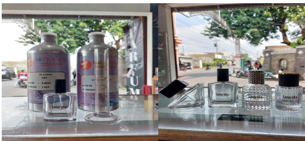
Figure 1. Perfume Products that are the Object of Research

Qualitative research allows researchers to conduct in-depth interviews with consumers and stores. This interview method is conducted in a semi-structured manner, which allows the researcher to explore the respondents' answers more freely, but still be directed to dig up information relevant to the research topic [23].