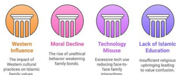
Figure 2. Challenges to Family Stability

Despite the strong emphasis Islam places on family bonds, several challenges threaten the stability and harmony of Muslim families today. These challenges arise from cultural shifts, technological advancements, and a decline in religious education. Below are the key factors affecting family cohesion: