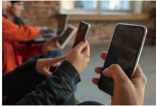
Figure 3. The Phenomenon of Online Gambling.