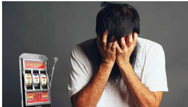
Figure 5. Depression and Stress

Indeed, sometimes there is a winner, but the chance of winning is very small compared to the chance of losing in a digital battle. The negative impact of online gambling makes them unable to manage their finances, even some of them even have to lie to their families using various excuses to do online gambling. Online gambling is a social disease that destroys religious, social, economic, and ethical values as well as family strength [43], [44].