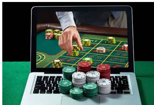
Figure 4. Online Gambling Techniques.