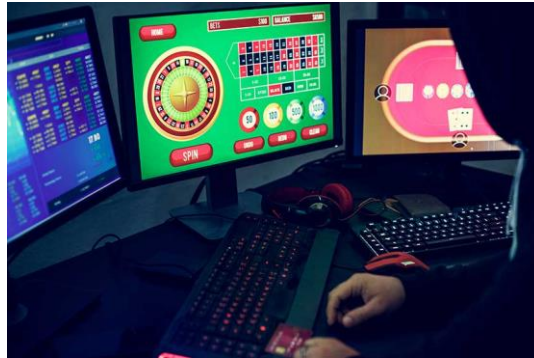
Figure 2. Types of Online Gambling.

"the factor that makes me play online gambling is because of the online gambling admin who promises to give me winnings". A beginner who plays online gambling will of course be influenced and attracted by the invitation [26]–[28].