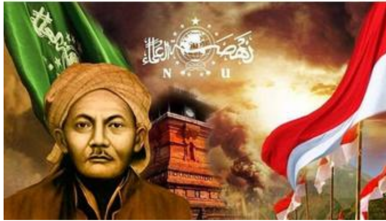
Figure 3. Hasyim Asy'ari, Organizational Movement of the Nahdlatul Ulama Period, and Indonesian Politics

Theoretically, the results of this study confirm that moderate da'wah in Hasyim Asy'ari's thought can be understood as a transformative da'wah based on tradition, namely da'wah that maintains the continuity of turats while being responsive to social dynamics [43]. This approach shows that tradition is not an obstacle to modernity, but rather a source of value that allows for the creation of an inclusive and just religious diversity [44]. Thus, Hasyim Asy'ari's thought not only has historical significance, but also offers a strong conceptual foundation for strengthening religious moderation in Indonesia today [45].