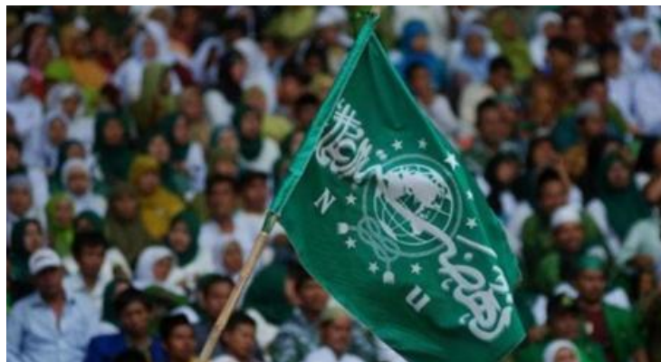
Figure 1. Flag of Nahdlatul Ulama

In the realm of da'wah studies, several studies emphasize that the da'wah model of pesantren developed by Hasyim Asy'ari is educational in nature and based on classical scientific transmission. Da'wah is understood as a process of character building through the strengthening of manners, the authority of sanad, and the internalization of moral values [13]. Works such as Adab al-'Alim wa al-Muta'allim are often analyzed from the perspective of Islamic educational ethics, with an emphasis on the teacher-student relationship and the formation of religious habitus. However, the reading of these works is rarely explicitly associated with contemporary religious moderation theory, so there has been no integration between educational ethics and the moderate da'wah paradigm in response to social plurality [14].