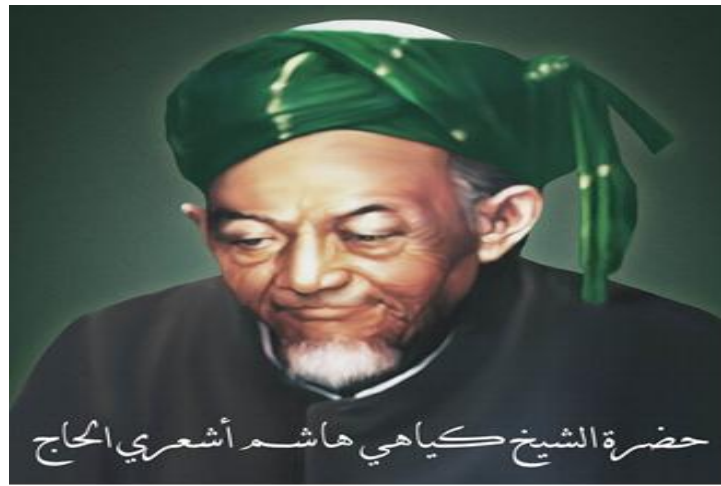
Figure 2. Photo of the Founder of Nahdlatul Ulama

The data sources in this study are divided into two categories, namely primary data sources and secondary data sources. Primary data were obtained from the main works of Hasyim Asy'ari, who represented scientific ideas, da'wah ethics, and religious views, such as Adab al-'Alim wa al-Muta'allim , Treatise Ahl al-Sunnah wa al-Jama'ah , as well as several religious treatises related to the tradition of Islamic boarding schools and the strengthening of Islamic values [24]. These works were chosen because they contain normative and conceptual principles related to the practice of da'wah and the formation of the religious character of the community. Meanwhile, secondary data were obtained from books, journal articles, dissertations, and previous research that discussed Hasyim Asy'ari's thought, religious moderation, da'wah theory, and sociological studies of religion that are relevant to the focus of the research [25].