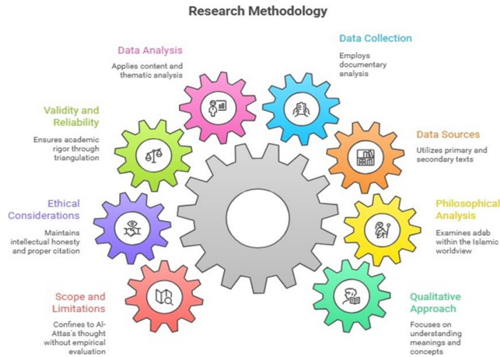
Figure 1. Research Methodology