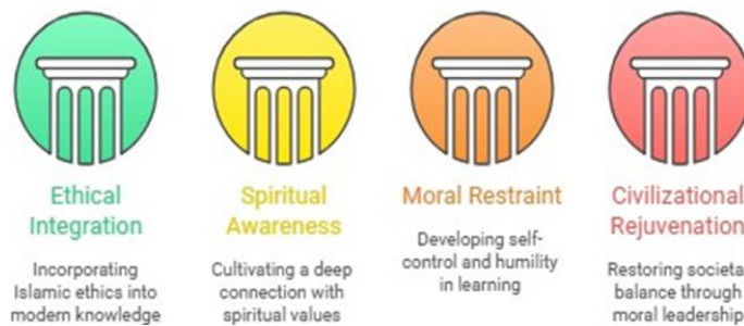
Figure 3. Foundations of Adab-Centered Education