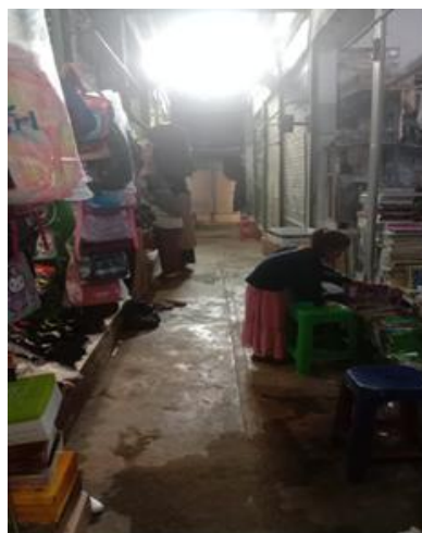
Figure 2. Inside the Author Creativity Market

However, this strategy is not static. After Ramadan ended, people's consumption patterns returned to normal and even decreased [22]. This condition is a challenge for traders. Therefore, marketing strategies in the post-Ramadan period must focus more on efficiency and maintenance of regular customers. Adjustments are made through reducing the volume of goods, cutting operational costs, and improving a personal approach to maintain customer loyalty.