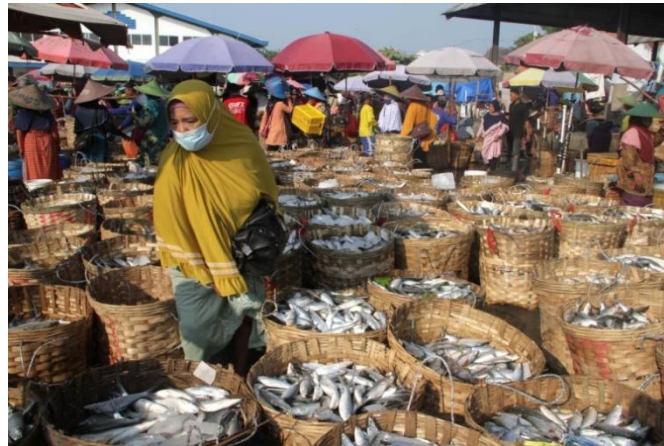
Figure 1. Fish Market

This condition is evident in Lamongan Regency, especially in Payaman Village and Paciran District, which have different geographical and social characteristics. Payaman Village, with its agrarian background, reflects a traditional market with a thick family trade pattern. Meanwhile, Paciran, [17]. In this context, traditional market traders are required to be able to read social and economic changes to adjust their marketing strategies.