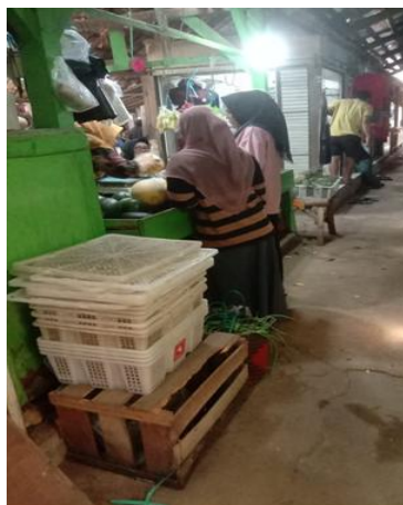
Figure 4. In the market. Author Creativity

Meanwhile, traders in Payaman showed an improvement in strategy during Ramadan, but on a more limited scale. On the aspects of price and consumer responsiveness, they recorded a score of 6 each, indicating adaptation efforts that still pay attention to price stability and long-term relationships with customers. Product promotions and variations remained low (scores of 4 and 5), indicating that traders in rural areas rely more on direct communication, consumer loyalty, and focus on the basic needs of the community.