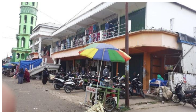
Figure 3. Parking lot Pasar Desa Payaman Solokuro Lamongan Pasar. Author Creativity

Based on the results of field findings, there is a striking difference between the two regions in implementing marketing strategies, both in terms of intensity and adjustment patterns. During the month of Ramadan, traders in Pantura Lamongan show a more aggressive and adaptive strategy compared to traders in Payaman. This can be seen from the high intensity score [33], especially in terms of price (9), operating hours (9), and product variety (8). This is influenced by the high market demand and the consumption style of coastal communities who tend to be consumptive during Ramadan. In addition, access to information and a high level of competition also make traders in Pantura more responsive to seasonal trends and needs.