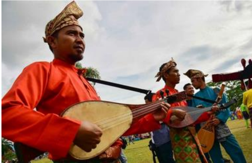
Figure 2. The Development of Gambus Music in Sumatera

Indonesia people. Gambus music that uses Middle Eastern musical instruments with Islamic lyrics shows the influence of Arabic culture that has been adapted to local tastes. The Dana Syarah dance, which tells religious stories, and the Hadrah dance, which combines dance movements with the prayer of the prophet, show the dual function of art as entertainment as well as da'wah. The results of interviews with traditional artists reveal that this art is not only preserved as a cultural heritage, but also continues to be developed and adapted to the needs of contemporary times. Islamic art in Sumatera Indonesia reflects a holistic approach in looking at the relationship between spirituality and aesthetics.