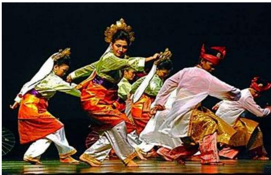
Figure 3. Zapin Dance of Arab and Sumatran Unity

Islamic arts such as zapin dance and gambus music show the creativity of the community in expressing religious values through accessible and interesting art mediums. This art doubles as entertainment and da'wah, reflecting an Islamic approach that values beauty as a reflection of God's majesty. The results of interviews with traditional artists revealed that Islamic art in Sumatera Indonesia continues to innovate and adapt to the needs of the times, but still maintains the essence of religious values that are the foundation. This phenomenon shows the vitality of Islamic culture in Sumatera Indonesia, which is not static but dynamic and responsive to the changing times. Islamic arts in Sumatera Indonesia also play a role as a medium for socializing religious values, which is more effective than formal da'wah, because it can reach various levels of society in a fun and non-patronizing way [36].