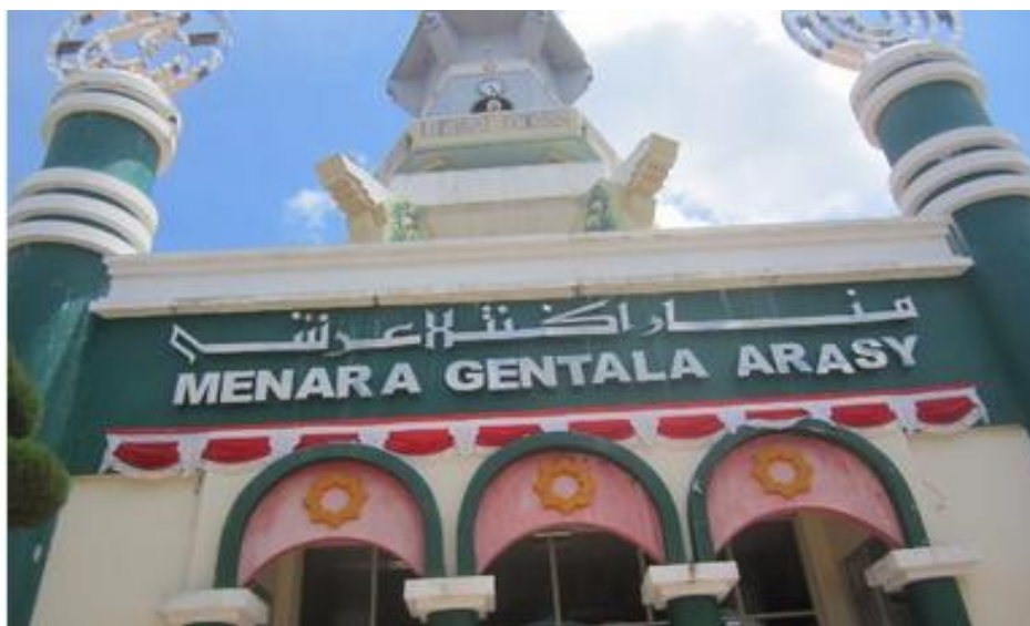
Figure 4. Gentala Arasy Museum in Sumatra

museums to the preferences of the digital generation. The function of museums as a learning medium has been proven to bridge the gap between traditional heritage and modern educational needs, so that Islamic heritage remains relevant and accessible to the younger generation [39].