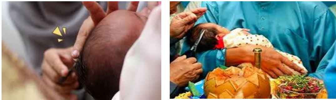
Figure 1 & 2. The Aqiqah Process Takes Place

level of the sunnah of mu'akkadah. This difference shows the breadth of Islamic jurisprudence and legal wisdom in adjusting to the conditions of the ummah [14].