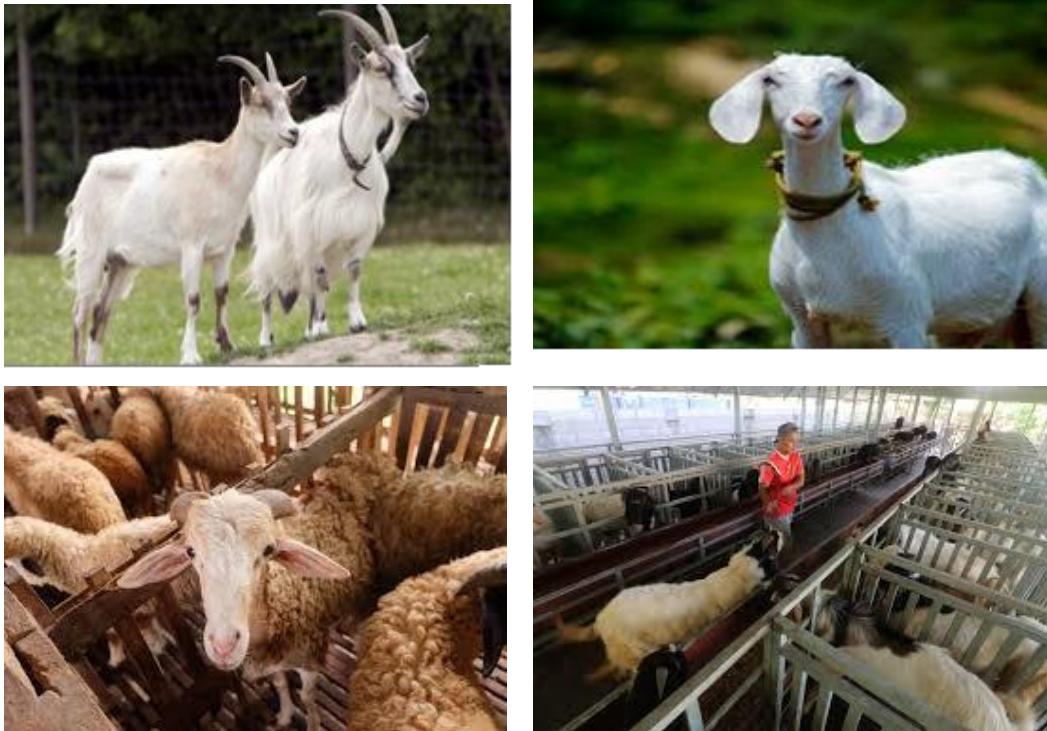
Figure 3, 4, 5 & 6. Goats that will be aqiqah

The implementation of aqiqah also shows variations in the form of implementation. In rural areas, aqiqah is usually carried out simply by slaughtering directly at home and distributing raw meat to neighbors and the poor. Meanwhile, in urban areas, this practice began to shift along with the emergence of professional aqiqah services. These institutions offer a complete package ranging from slaughter, processing, to delivery of ready-to-eat food [32]. This phenomenon shows the adaptation of Muslims to the demands of modern life, but at the same time presents a new challenge to legal awareness and sincerity of intention in worship [33].