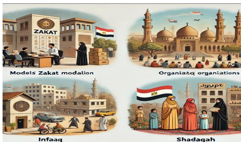
Figure 1. Model of Zakat Infaq Shadaq in Egypt

The current socio-economic landscape in Egypt calls for innovative approaches to Zakat, Infaq, and Sadaqah [24]. Traditional practices must adapt to the realities of modern challenges, ensuring that these systems can effectively address the needs of vulnerable populations [25]. This adaptation may involve leveraging technology for better fund distribution, enhancing collaboration between governmental and non-governmental organizations, and fostering community engagement in charitable initiatives [26].