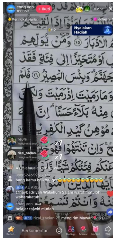
Figure 2. Tilawah via tiktok.

So, in the Hanbali School whether or not to be rewarded for work related to worship is determined based on its purpose, whether for public benefit or self-approach to Allah Subhanahu wa Ta'ala.