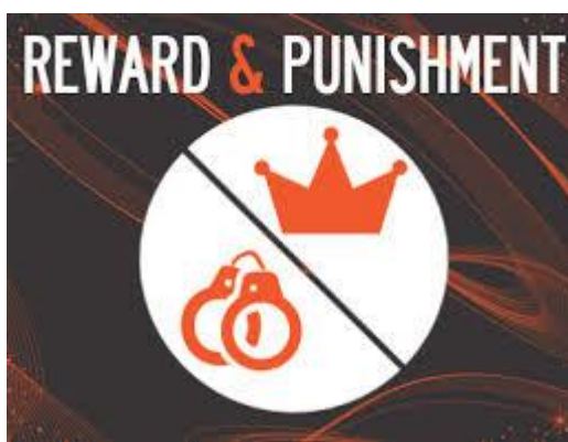
Figure 2. Ilustarsi Reward and Punishment

So the affirmation, overall, is that the use of reward and punishment is an integral part of performance management in educational and organizational contexts. However, an effective strategy must take into account individual preferences, organizational culture, and principles of fairness. A balanced approach between positive reward and fair punishment can create a work environment that motivates teachers and employees to achieve common goals and develop their professionalism. Hopefully, this literature review provides a comprehensive overview of the use of reward and punishment to motivate teachers and employees [34], [35].